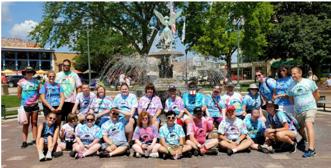
SEASPAR enjoys a day in Lake Geneva City

It is always a sad time when SEASPAR heads out of camp. This group of campers celebrated its 17 th summer here with us and each year these campers are more of a hit than the previous summer. They enjoyed fishing, boat rides and their annual trip to Lake Geneva City where they took the ice cream boat tour around the lake.